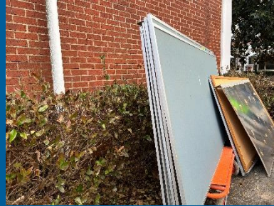
Disposal of remaining markerboards and tackboards