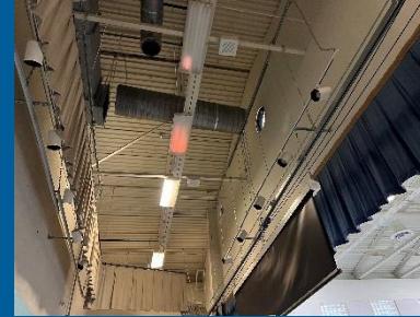
Installation of spiral duct in Area A