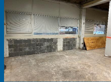
CMU infill complete at Area D