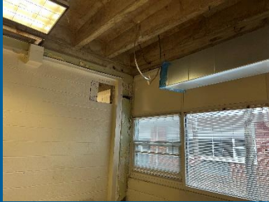
Coring of holes for ductwork in Area E