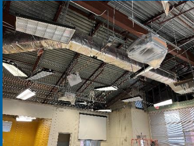
Linesets connected to VRF cassettes in Media Center