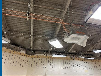
Linesets connected to VRF cassettes in Area C