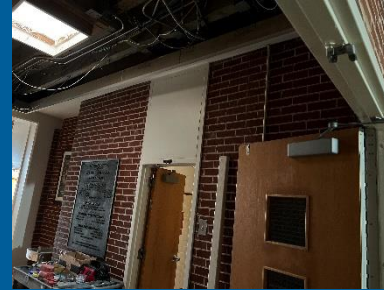
Installation of emergency lighting conduit in Area E